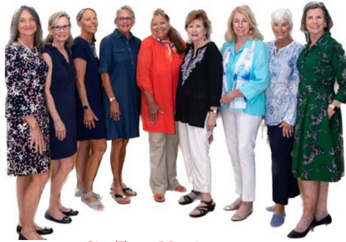
Site Team Members

Selecting one of the five deserving programs was a difficult choice this year for the many Circle members who voted at the April Closing Reception, after the Site Teams had ably presented each program at the March meeting. Based on the vote, Museum Explorations will be fully funded at $37,953 and A+ART/Rise Expansion will be partially funded at $6,127.